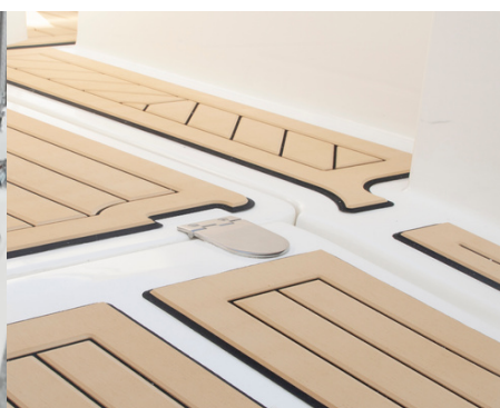
SOFT TEAK & FLEXITEEK